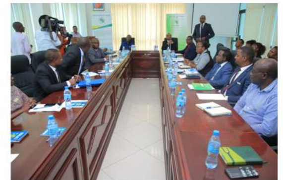
Hon. Simbachawene, the Minister for Constitutional with other officials from the Ministry in a meeting with the staff of the Law School of Tanzania during their visit to the School