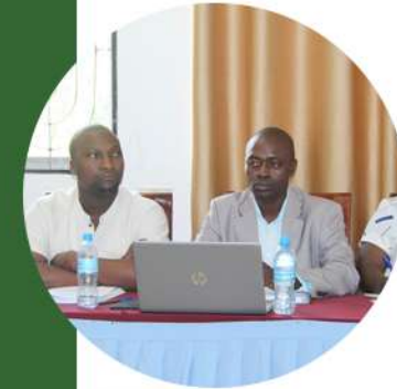
THTU representative members following the meeting discussions