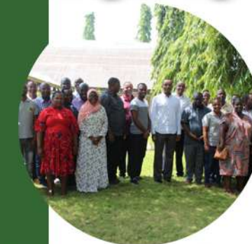
A group photo of the Council members during the 13th LST Workers' Council