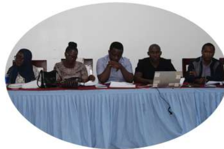
Members of the Council following the meeting discussions

It is in this Workers' Council Meeting were the 2022/23 Draft of the Financial Year Budget was discussed and fine-tuned into details and shared with all staff, ready to be submitted to the Ministry of Constitution and Legal Affairs Ministry. Many other important matters were discussed during this meeting including the 5 Year LST Strategic Plan (2021 – 2026) that detailed the implementation of the Eight Strategic Objectives that are aimed at Law School of Tanzania Services and Infrastructural Development.