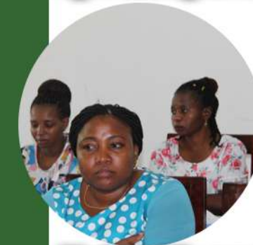
Members of the council members during the meeting