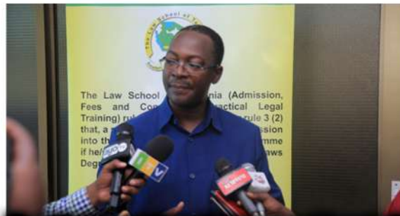
The Minister of Constitutional and Legal Affairs Hon. George Simbachawene (MB), speaking to the media during his visit to the Law